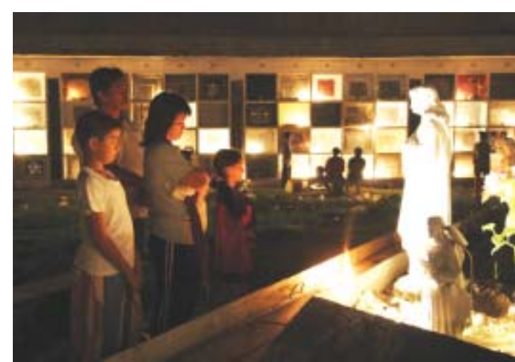
A family stands silently in front of the grave of departed relatives at the Carreta Cemetery in Cebu City. People all over the country flocked to the cemeteries even before Tuesday's celebration of All Saints Day.