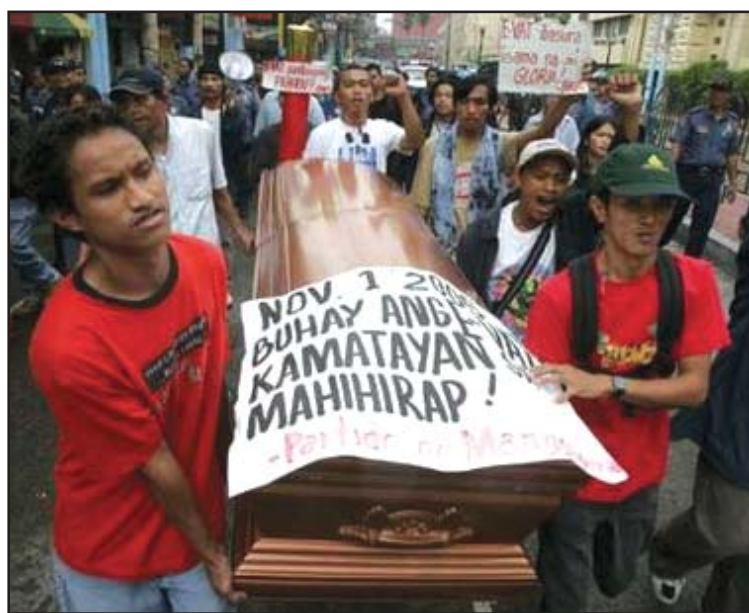
Protesters shout slogans and clench their fists as they attempt to march towards the Malacañang palace in Manila to denounce the implementation of a new expanded value added tax law on All Saints Day Tuesday.